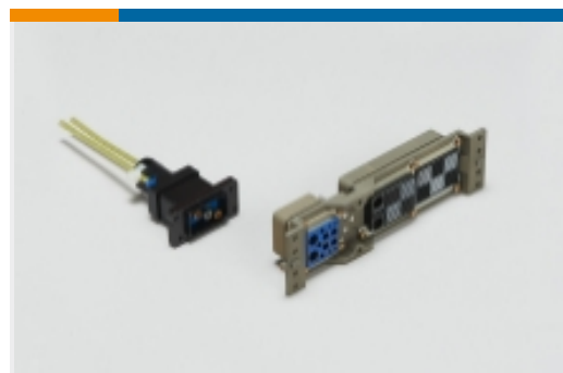
Rack & Panel Connectors(7)