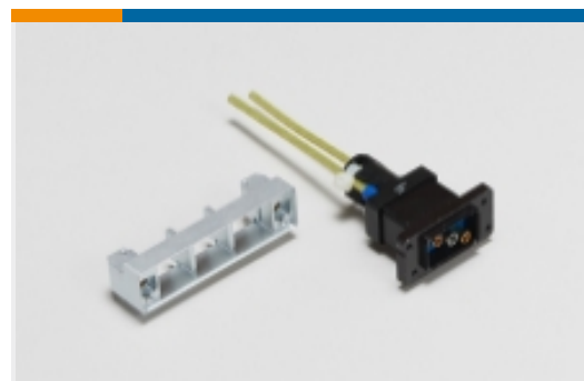
Other Rack & Panel Accessories(8)