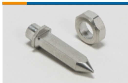
Rack & Panel Keying(4)