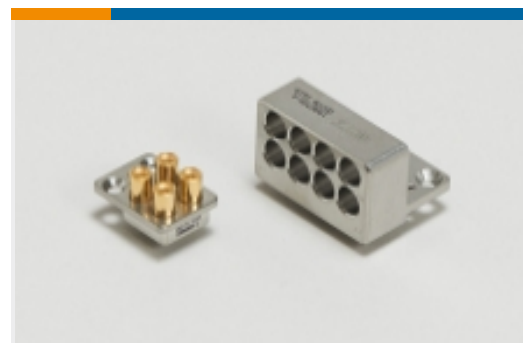
PCB RF Modules(1)